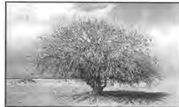
The ancient tree near as-Safawi (4G)