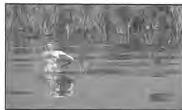
The River Jordan