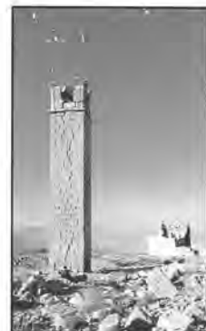
Umm ar-Rasas ( Mayfa'a ) (6E)