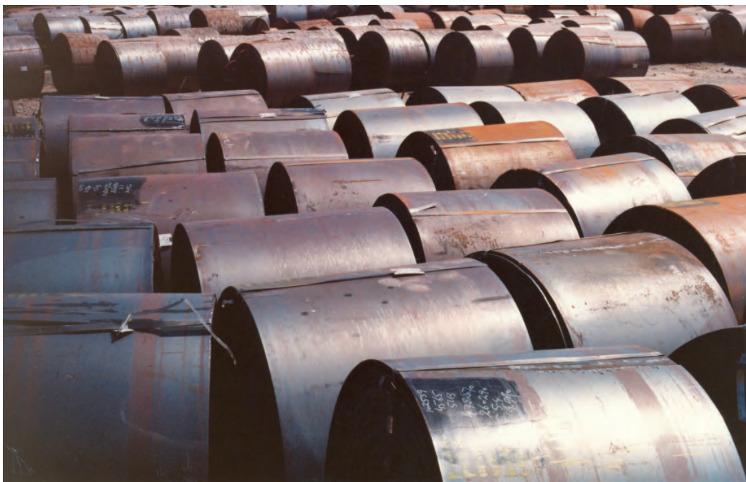
Photograph E for Question 4