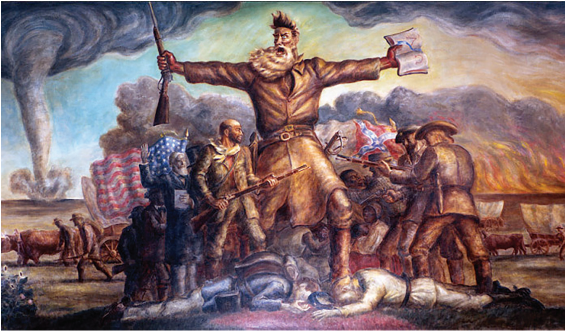
A mural entitled 'Tragic Prelude', from the late 1930s. It shows John Brown in Kansas during the 1850s. The book in his hand is the Bible. A prelude is an event that is an introduction to something more important.