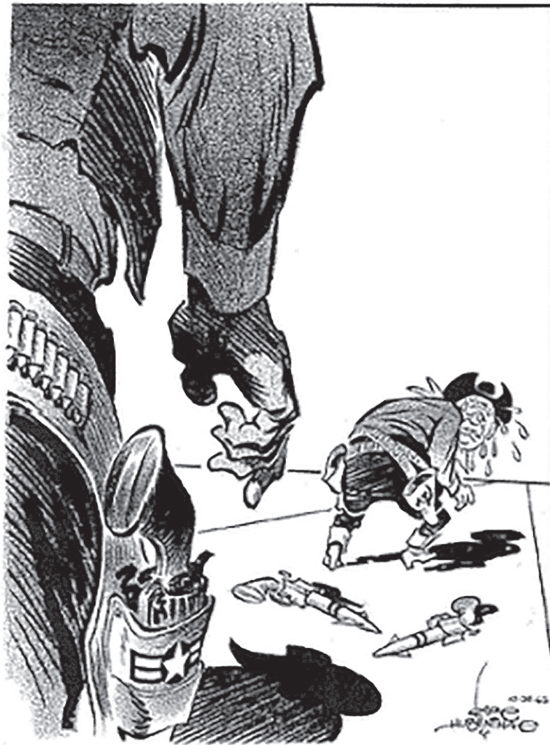
A cartoon published in an American newspaper, 29 October 1962. The figure on the right represents Khrushchev.