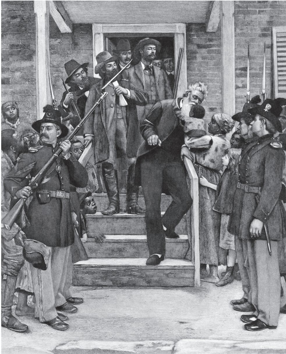
An illustration called 'The Last Moments of John Brown', published in Philadelphia in 1885. It shows Brown leaving jail on his way to his execution. The artist has shown Brown kissing a black child as described at the time in a Northern newspaper. However, most accounts say that only soldiers were present when Brown left the jail.