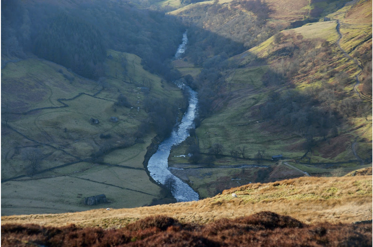
Photograph A for Question 3