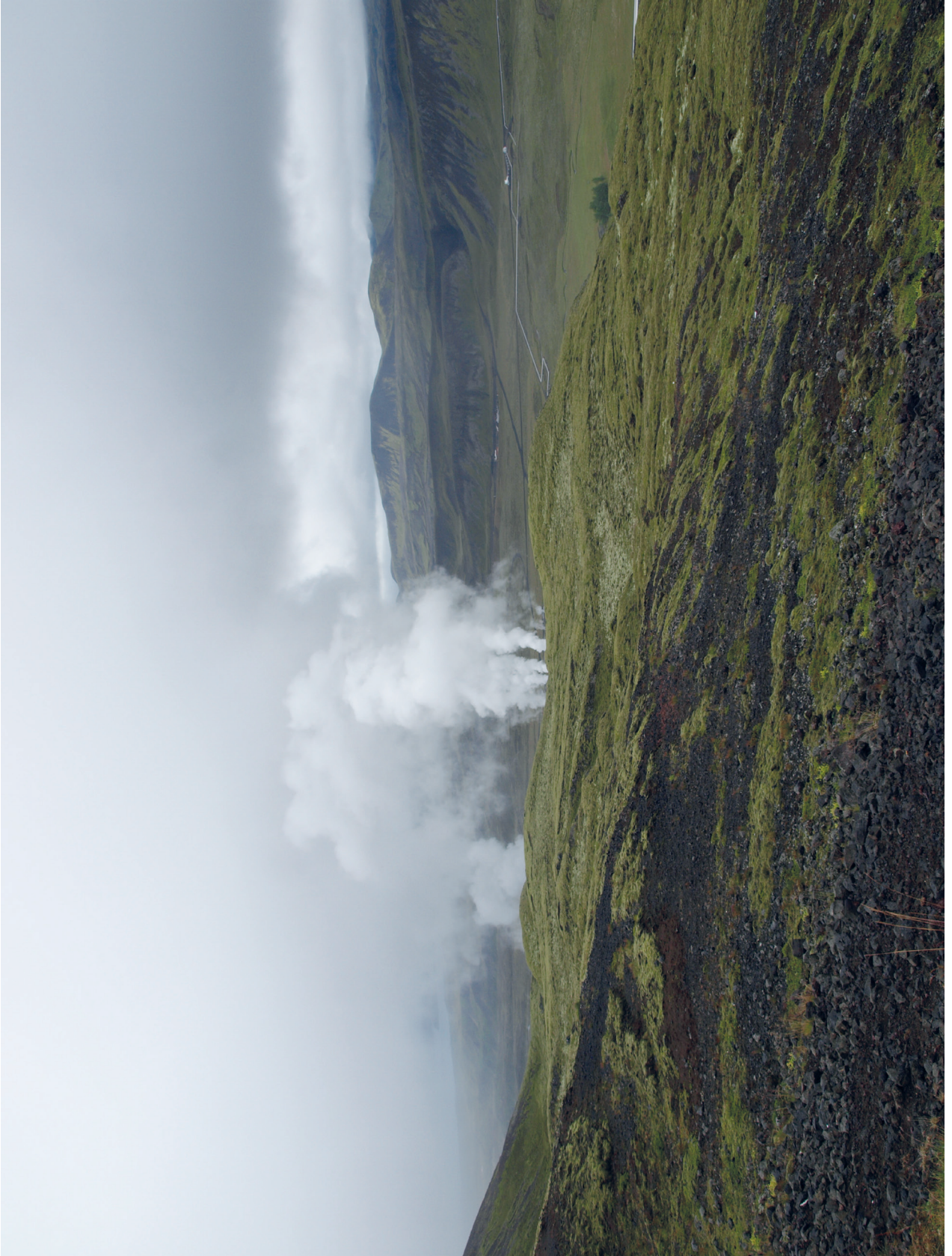
Photograph A for Question 1