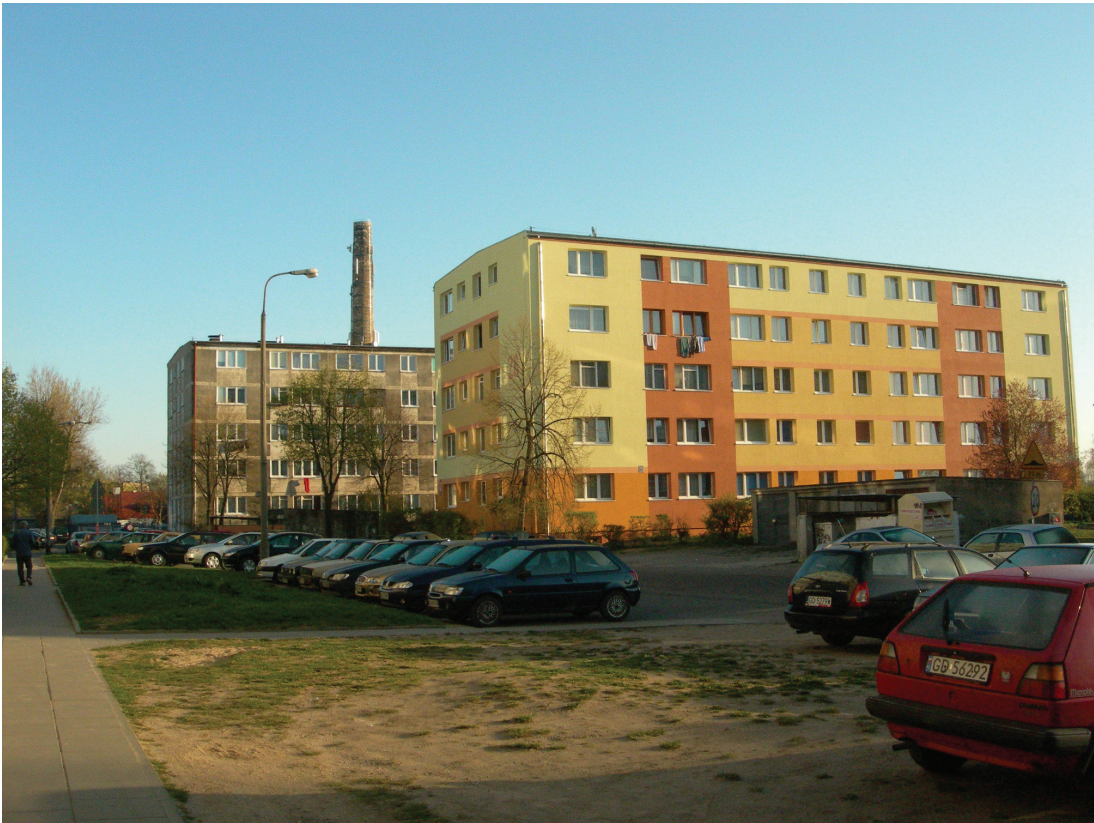
Photograph B showing area B for Question 2