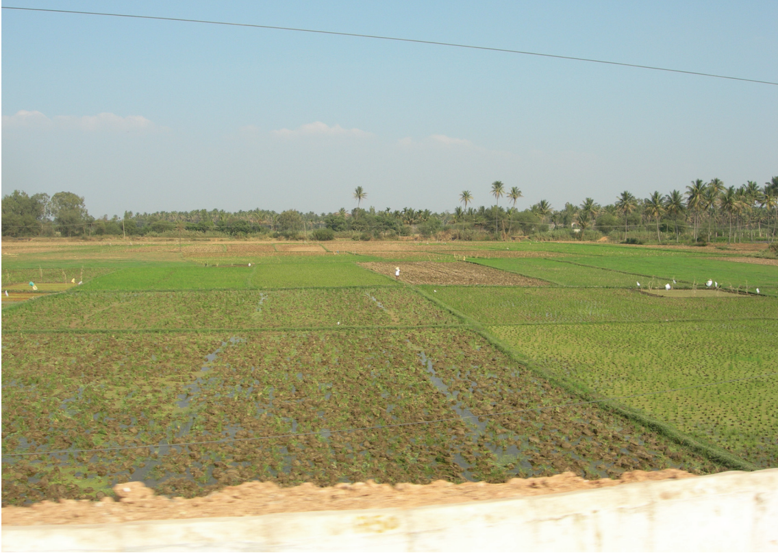
Photograph E for Question 6