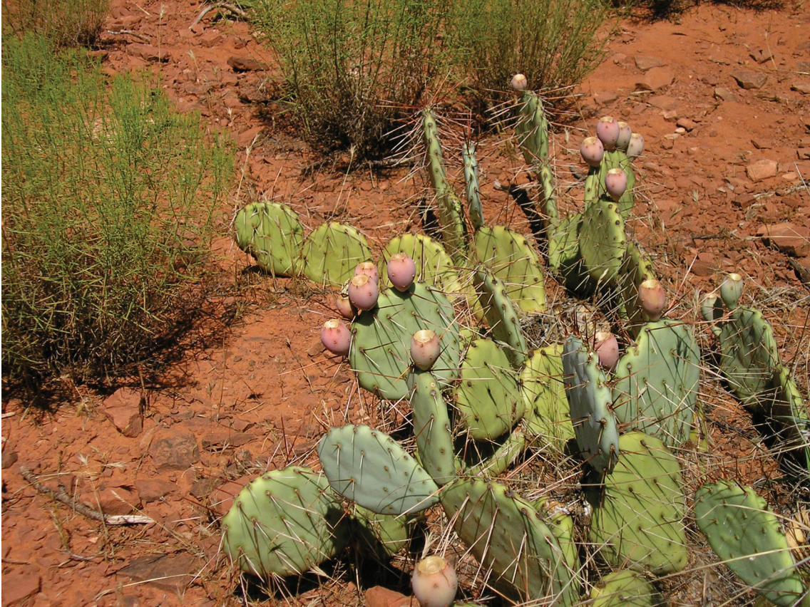
Photograph C for Question 6