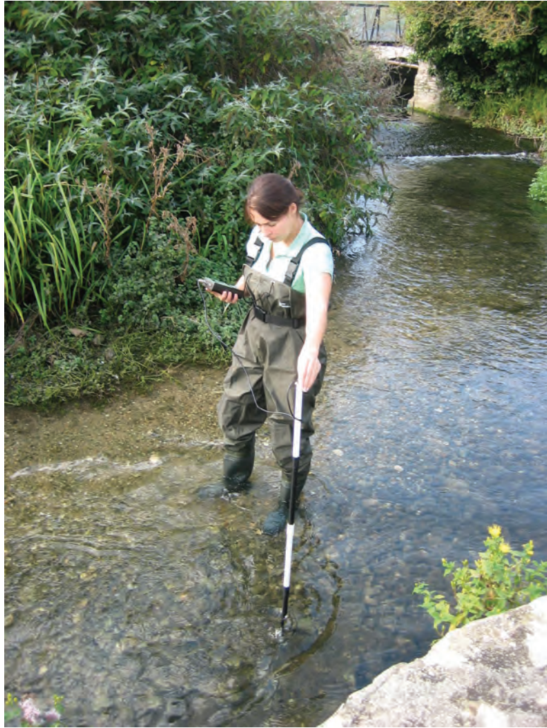
Photograph B for Question 8