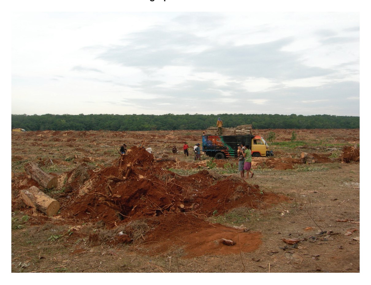
Photograph D for Question 5