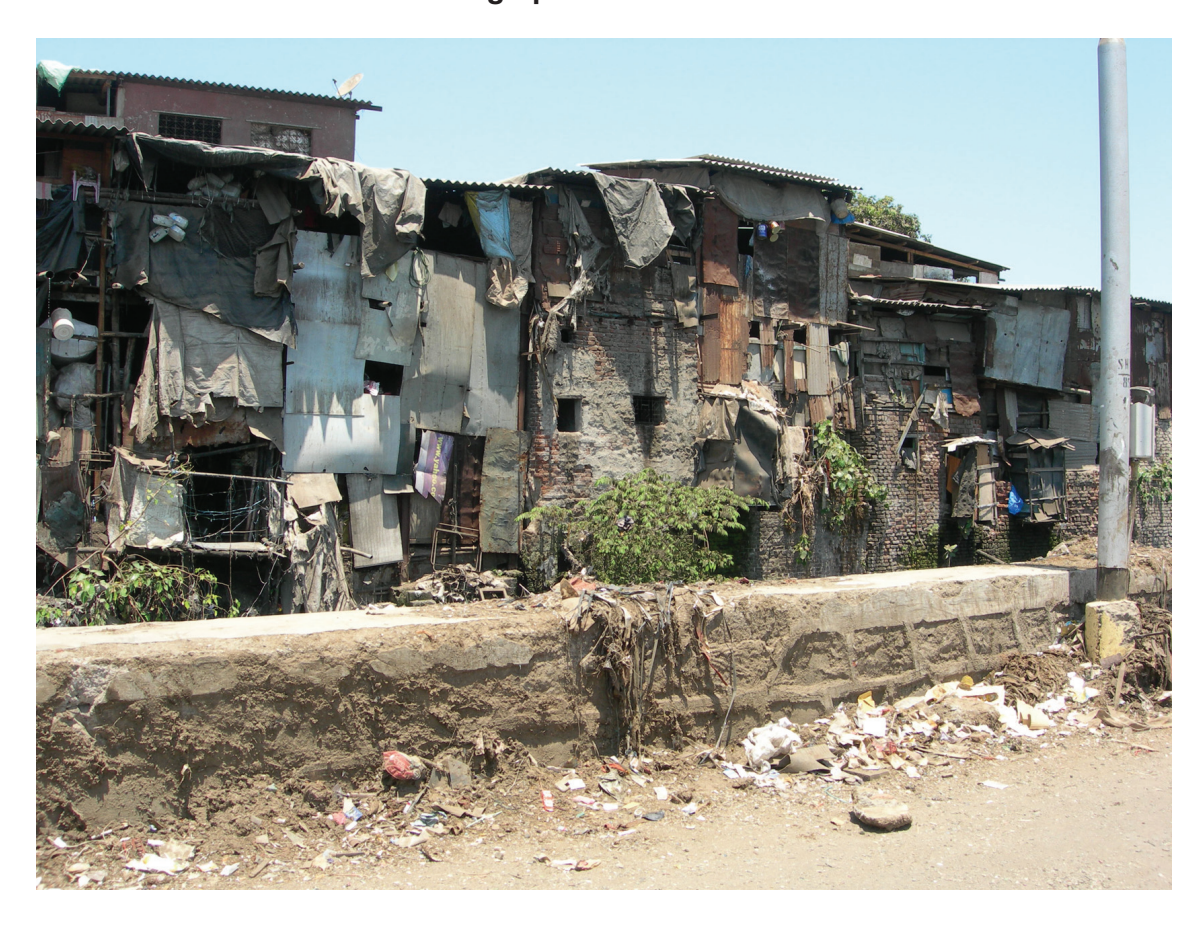
Photograph B for Question 3