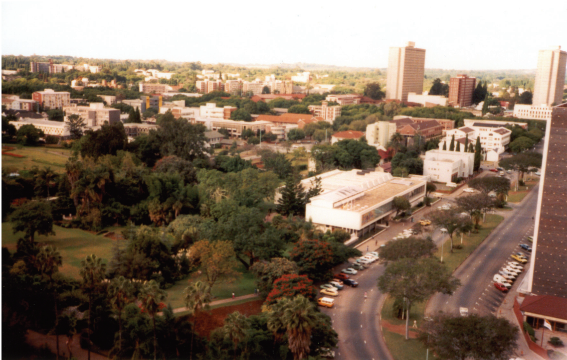
Fig. 8 for Question 6