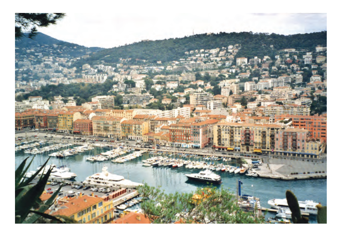
Photograph B for Question 2