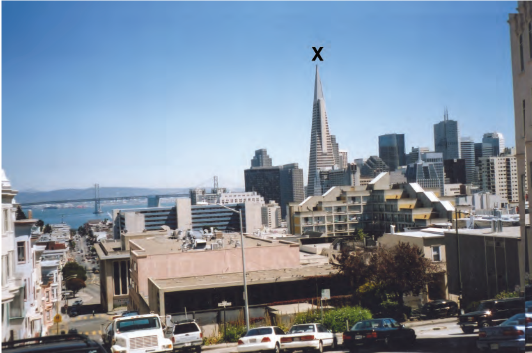
Photograph C for Question 3