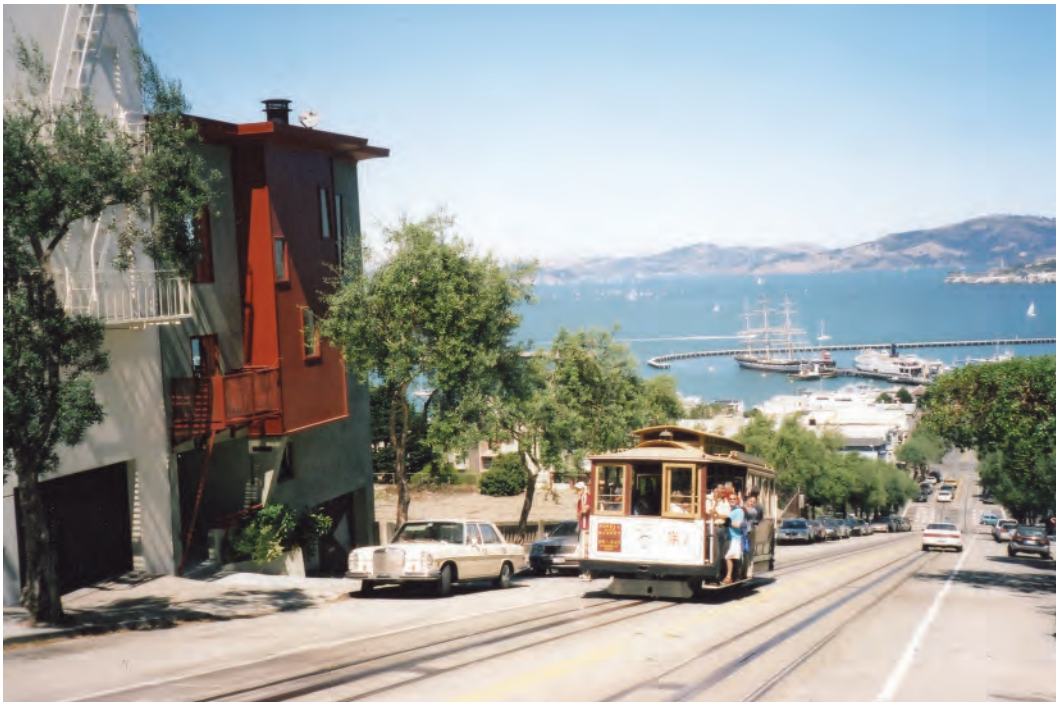
Photograph C for Question 3 is on page 4