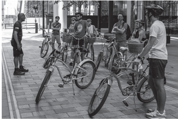
Fig. 3.1 for Question 3