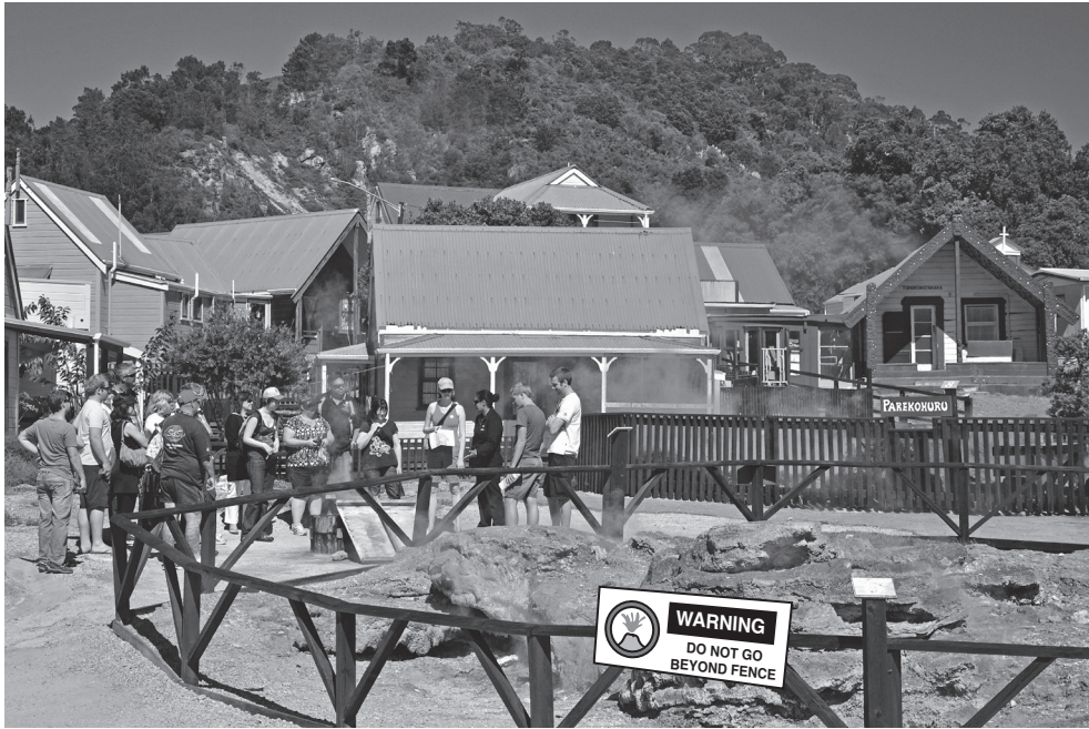
A group of tourists viewing a geothermal vent as part of a guided tour.