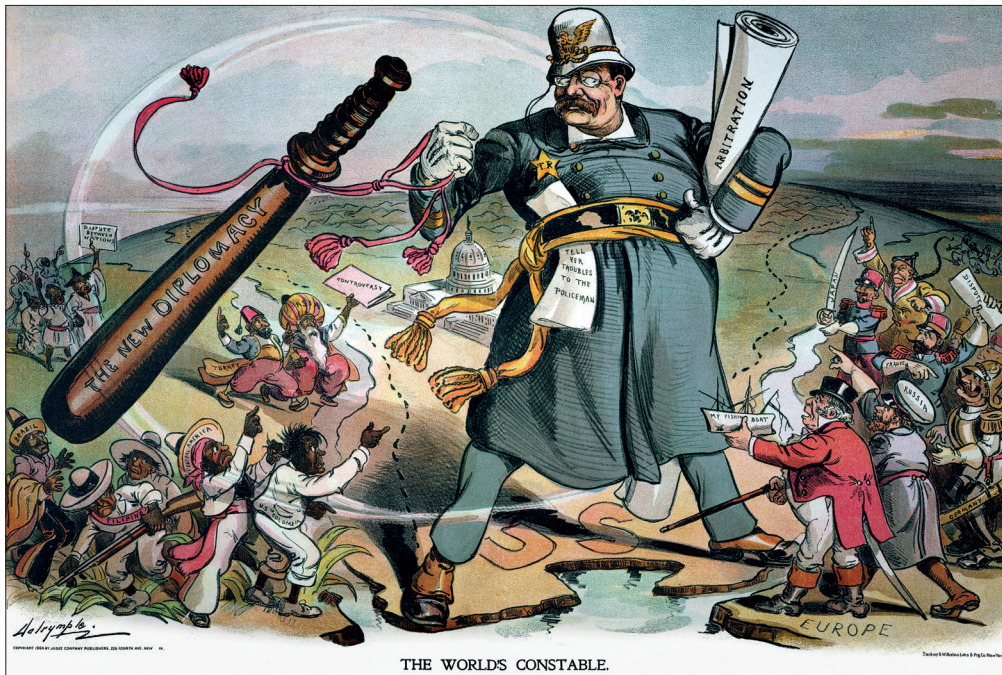
A cartoon called “The World’s Constable” published in an American newspaper in 1905.