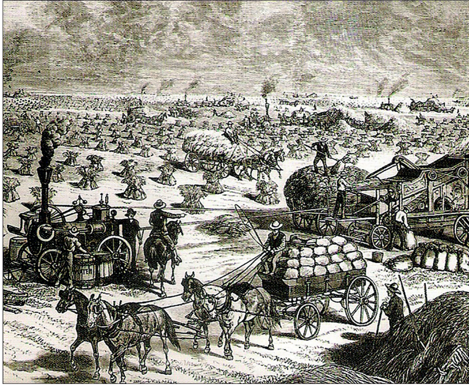
A contemporary print showing the great wheat fields of the Red River Valley, Dakota, in 1878.