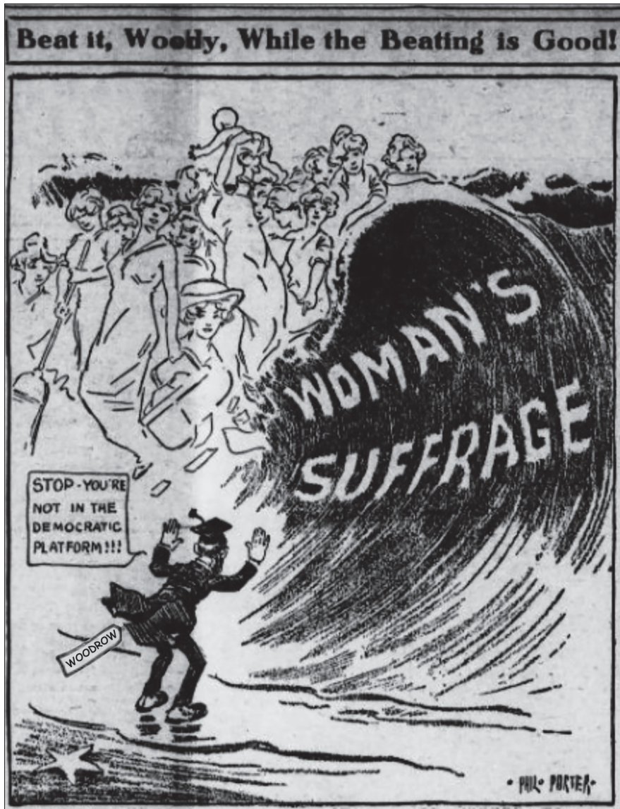
A cartoon that appeared in the "Tacoma Times" Washington State newspaper in August 1914.