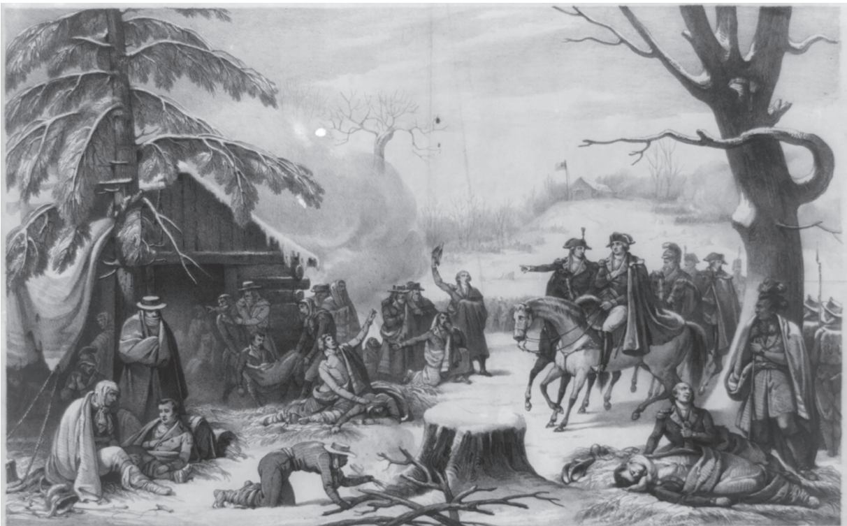
“Valley Forge, 1777,” painted in 1869 by a French artist who admired Lafayette. It shows General Washington and the Marquis de Lafayette, a French officer who served with Washington, visiting some troops of the Continental Army.