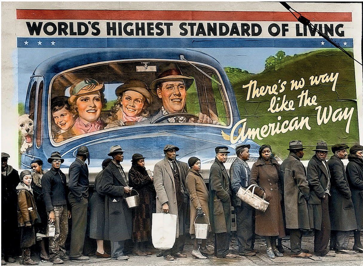
A photograph taken in Louisville, Kentucky, 1937. People wait in line for food and clothing from a relief station in front of a billboard.