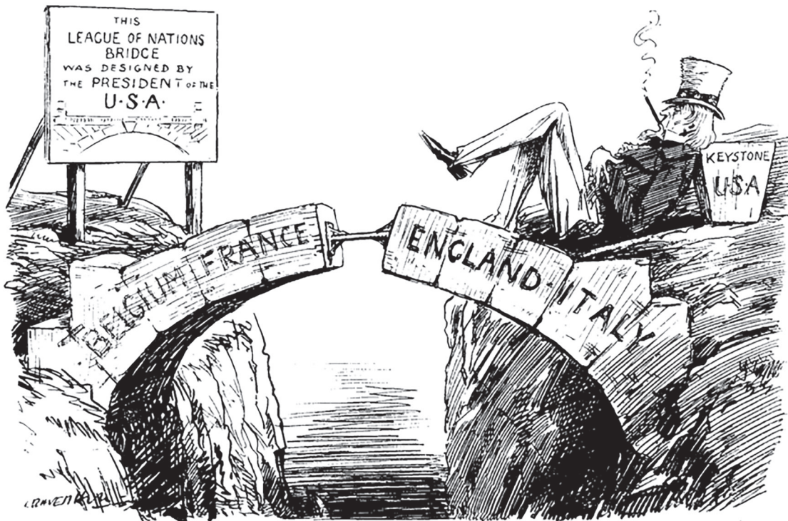
THE GAP IN THE BRIDGE.

A cartoon published in a British magazine, December 1919. The keystone is the stone that locks the structure together.