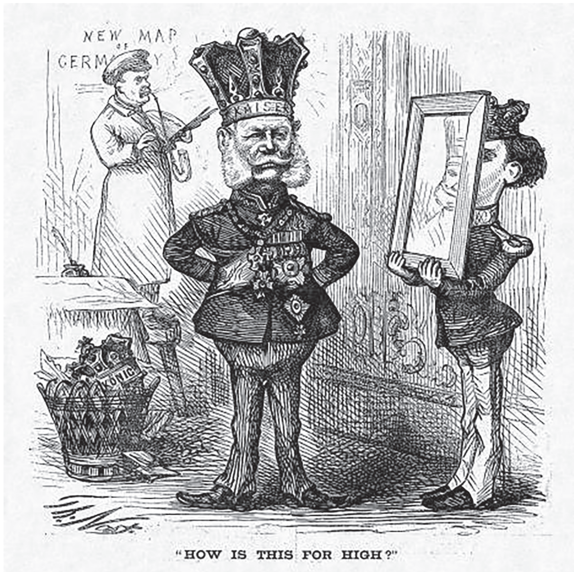
A cartoon published in an American magazine, 7 January 1871. Bismarck is in the background. William's Prussian crown lies in the waste bin.