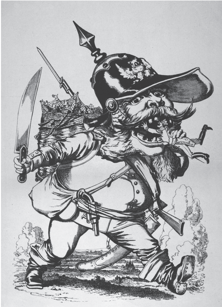
A French cartoon published in early 1867. It is entitled 'The Giant German Ogre'. It shows William and some small figures which represent the princes of North Germany.