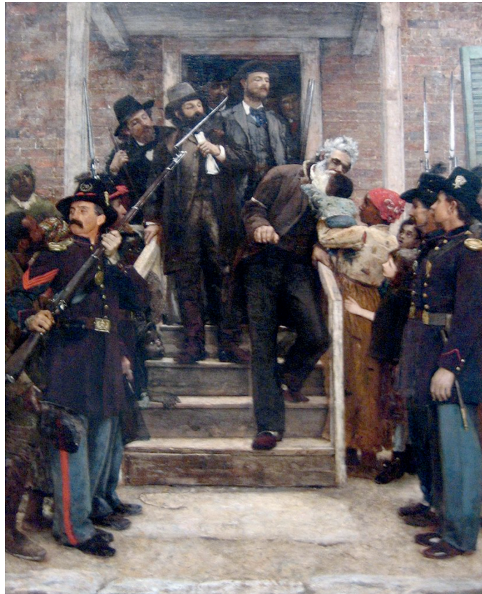
'The Last Moments of John Brown' painted in 1859.

3 Look at the painting, and then answer the questions which follow.