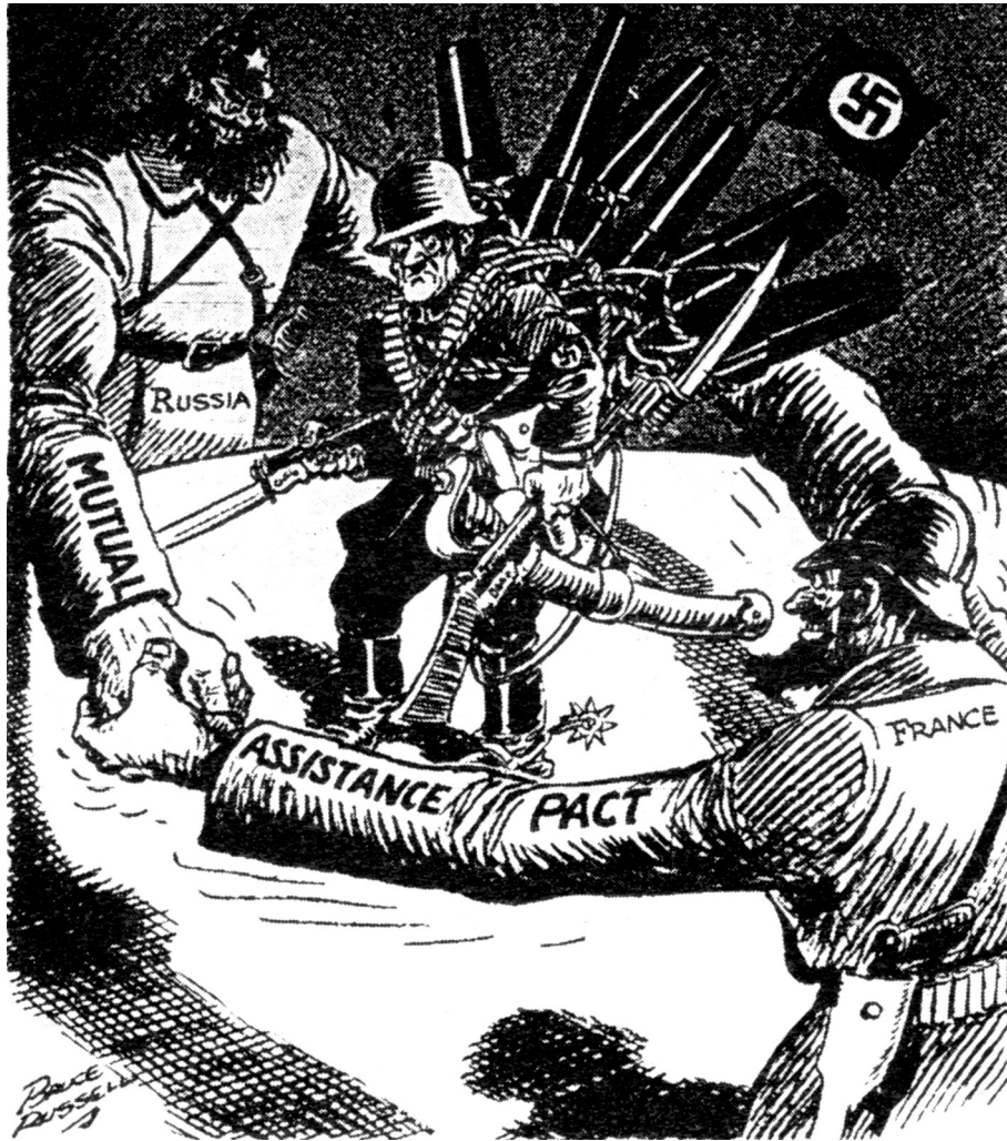
An American cartoon published in March 1936.