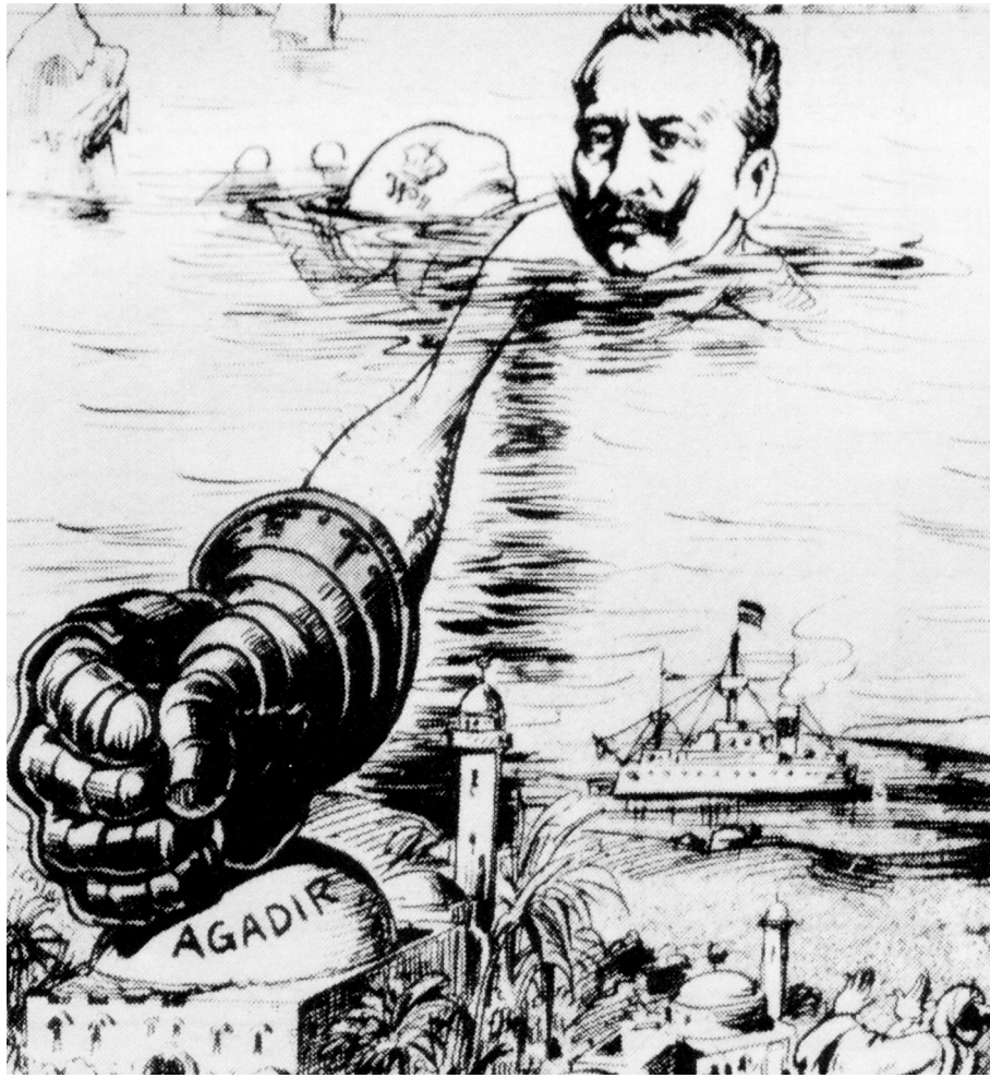
A cartoon about the Second Moroccan Crisis, published in 1911.