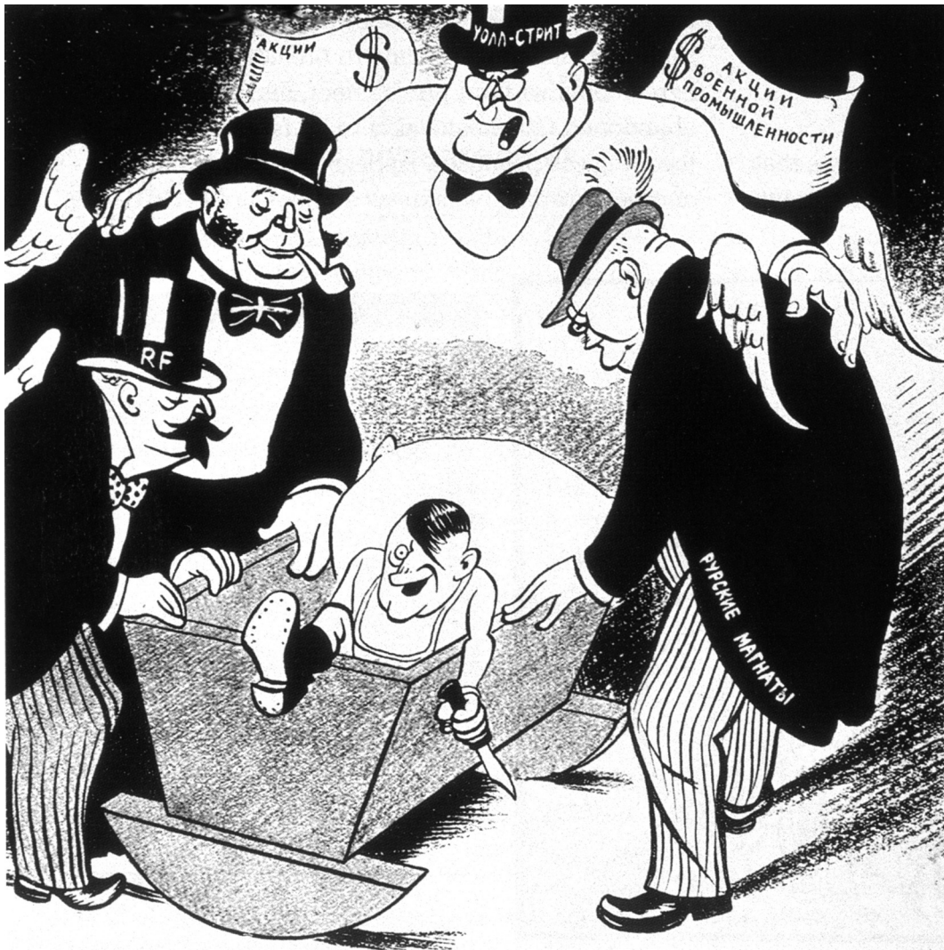
A Soviet cartoon published in 1936. It shows the western countries with Hitler.