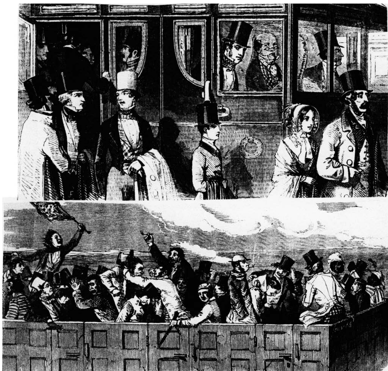
Pictures from the Illustrated London News in May 1847, entitled 'On Their Way To Epsom Races By Train. First and Third Class Carriages'.