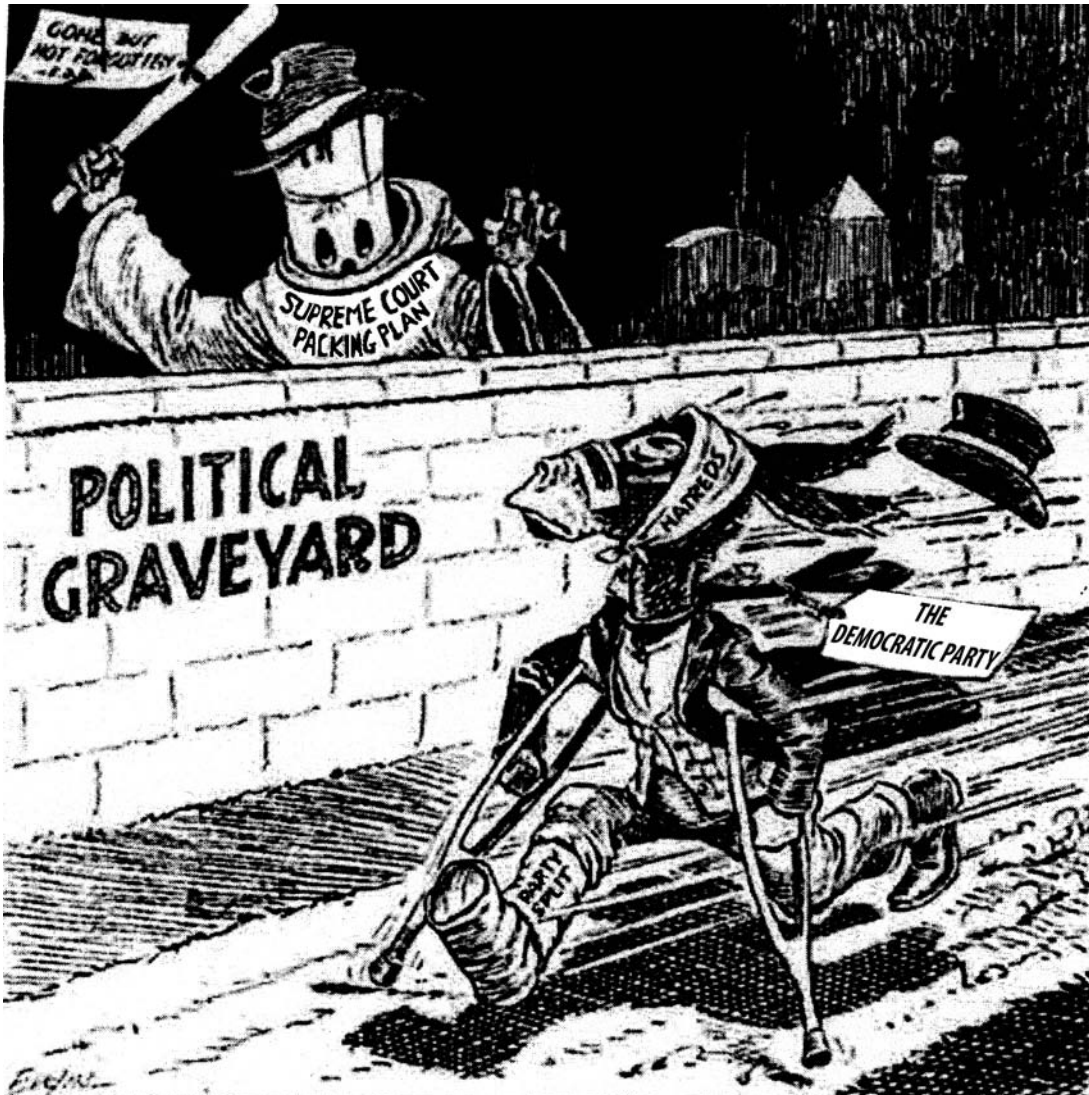
An American newspaper cartoon of 1937.