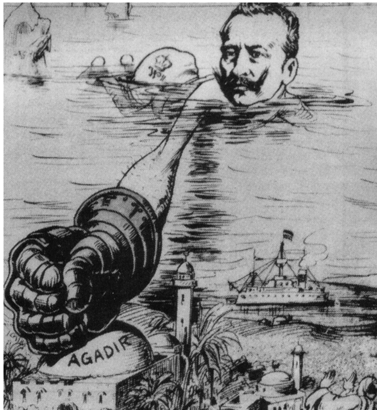
A German cartoon entitled 'The Iron Fist of Agadir', published in 1911.