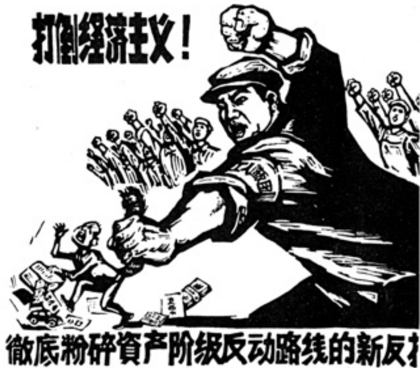
The Red Guards dealing with opponents during the Cultural Revolution.

16 Study the cartoon, and then answer the questions which follow.