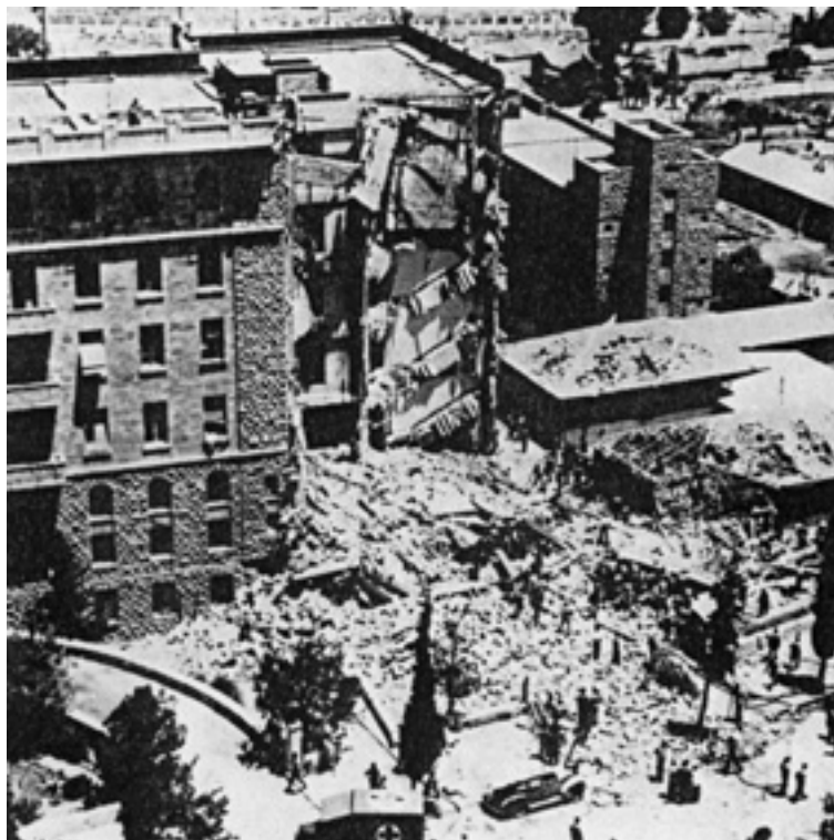
The King David Hotel, July 1946.

20 Study the picture, and then answer the questions which follow.