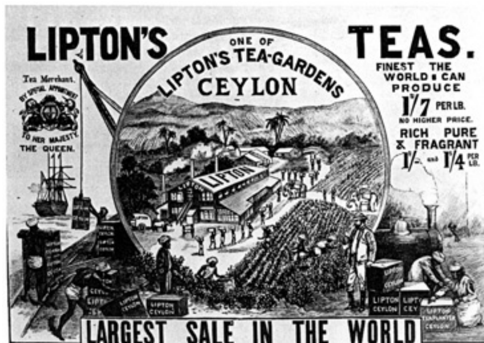
A Victorian advertisement showing a tea plantation.

24 Study the picture, and then answer the questions which follow.