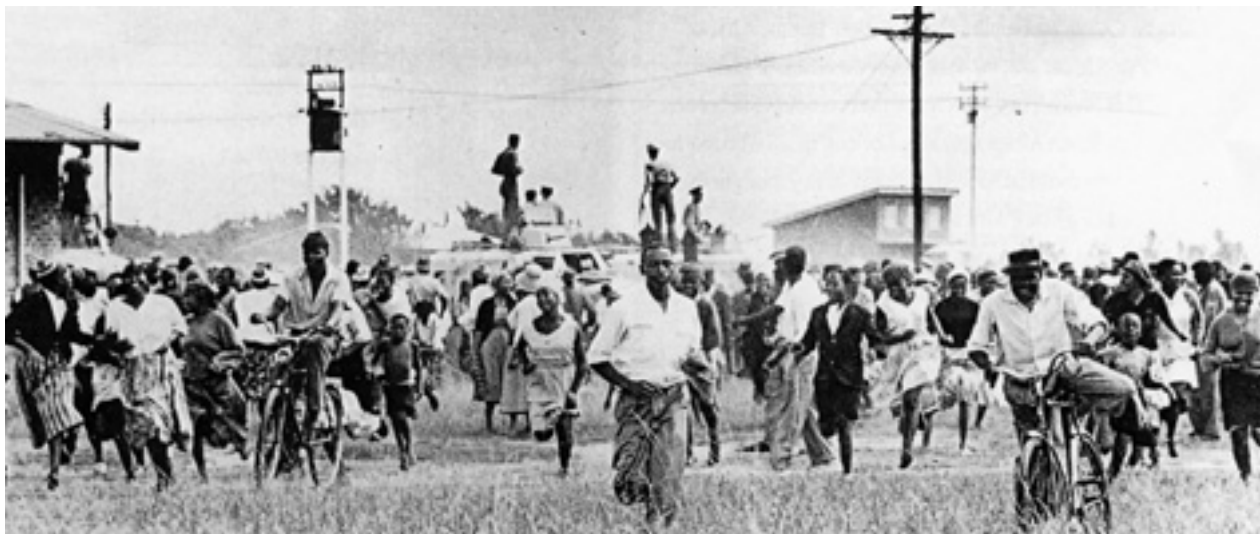
Protesters fleeing from the bullets at Sharpeville, 1960.

17 Study the picture, and then answer the questions which follow.