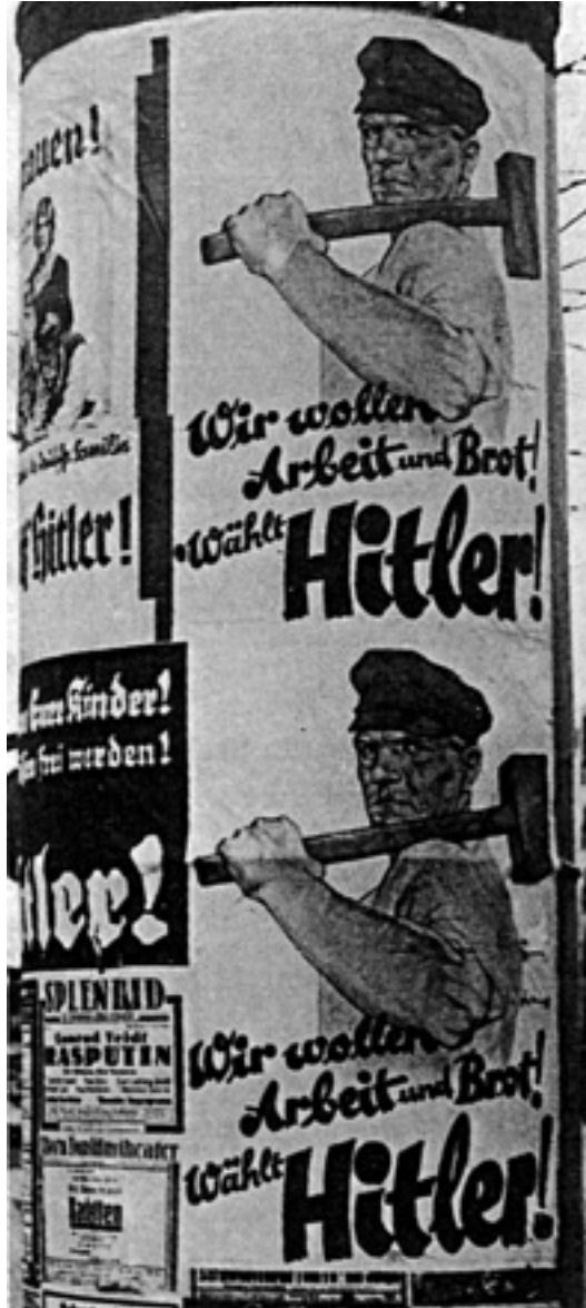
A 1932 election poster. It says 'We want work and bread. Elect Hitler'.