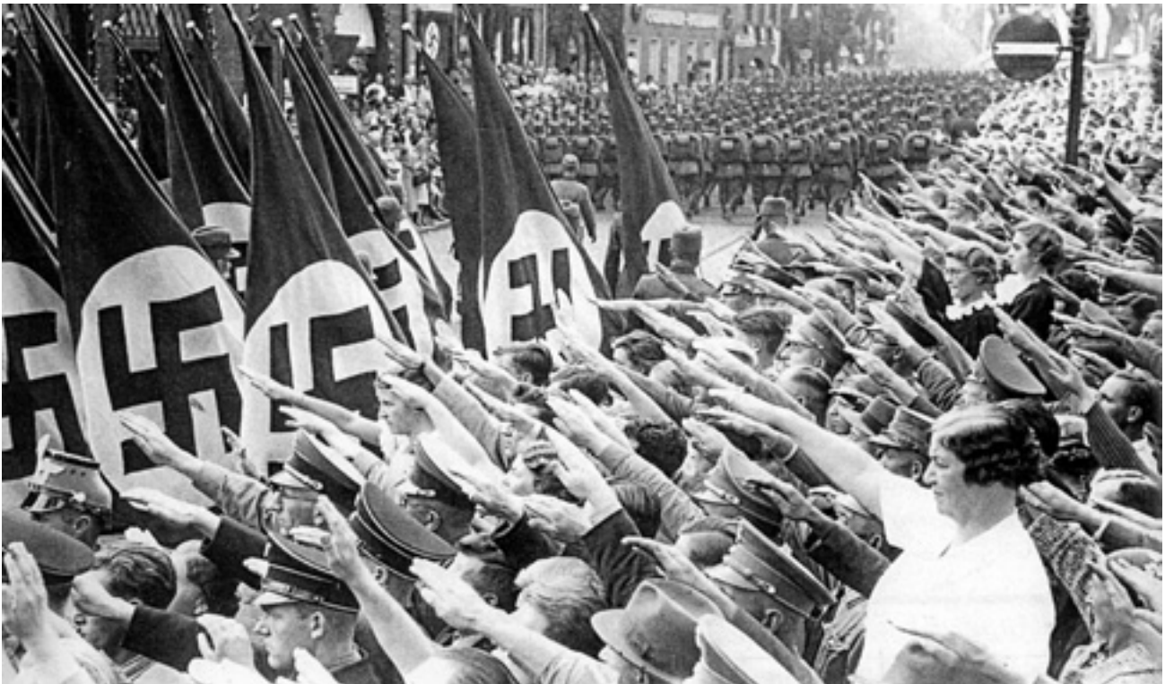
Crowds at the 1936 Nazi Party rally in Nuremberg.

10 Study the picture, and then answer the questions which follow.