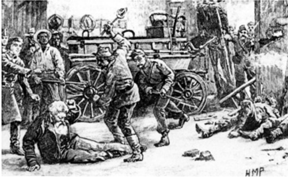
The capture of John Brown at Harper's Ferry, 1859.