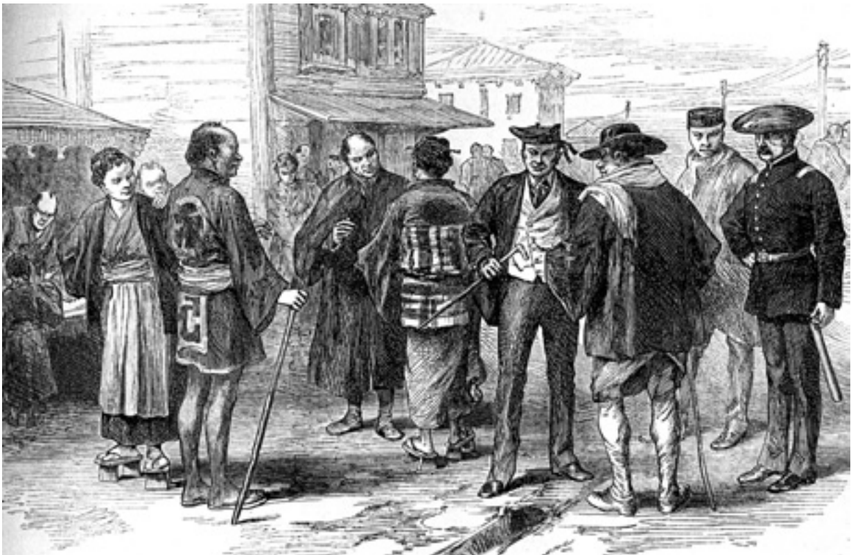
Traditional and western costume in Japan, 1873.