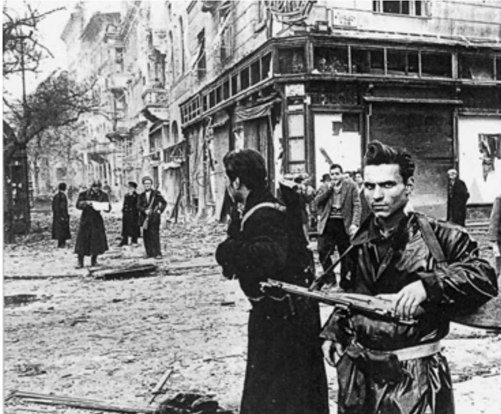
Hungarian rebels in Budapest, November 1956.