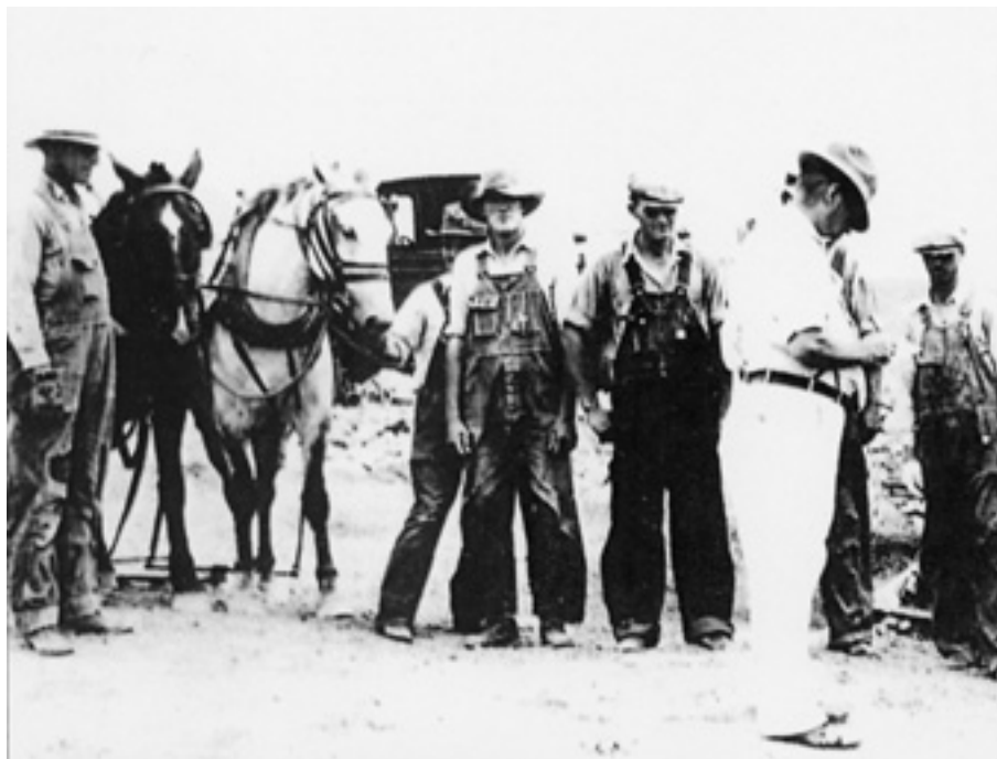
Unemployed farm workers in the 1920s.

13 Study the picture, and then answer the questions which follow.