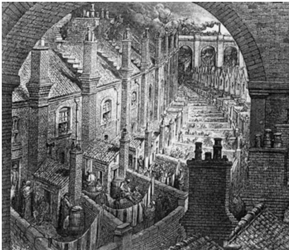
Housing in London, 1875.

22 Study the picture, and then answer the questions which follow.