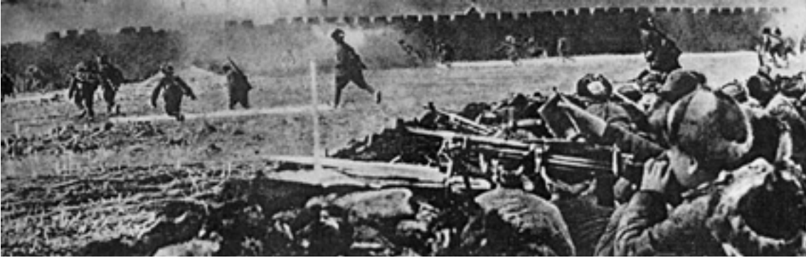
A photograph of Communist troops advancing in the Civil War.

15 Study the photograph, and then answer the questions which follow.