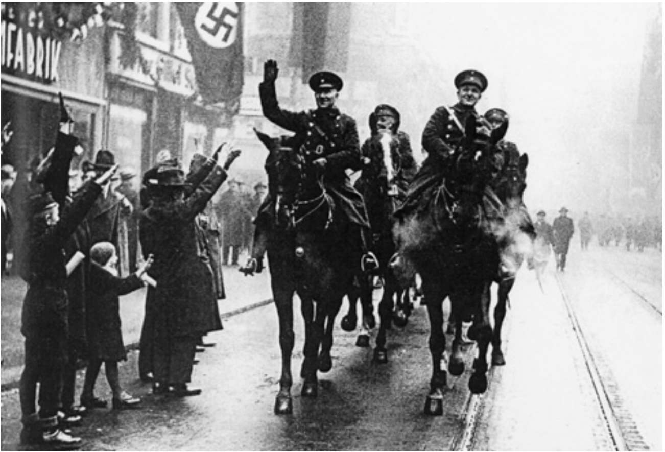
People in the Saar celebrating the results of the 1935 plebiscite.

6 Study the photograph, and then answer the questions which follow.