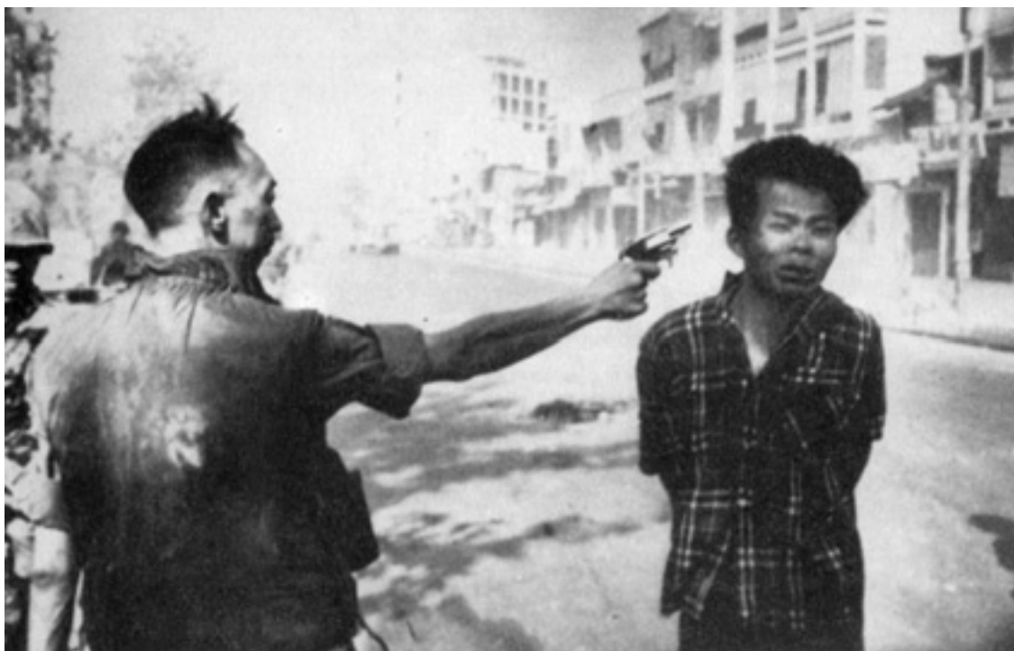
The execution of a Vietcong suspect during the Tet offensive, 1968.