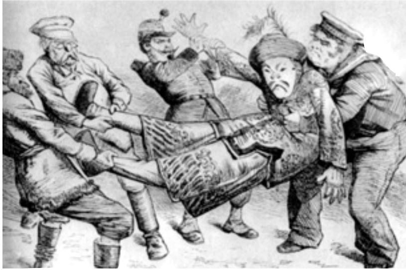
A nineteenth-century cartoon showing China being pulled by several European countries in different directions.

24 Study the cartoon, and then answer the questions which follow.