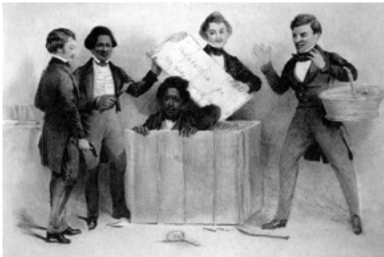
The escape of a slave from Richmond, Virginia to Philadelphia in the North.