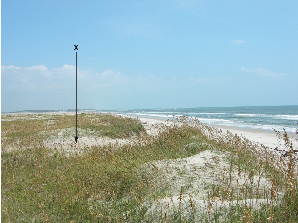
Fig. 3.1 for Question 3