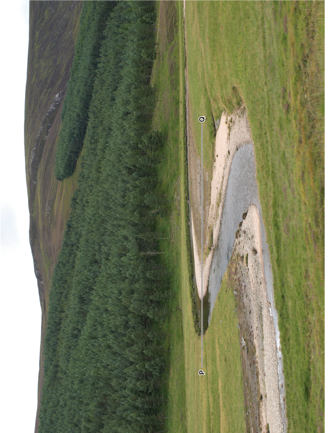
Photograph C for Question 4