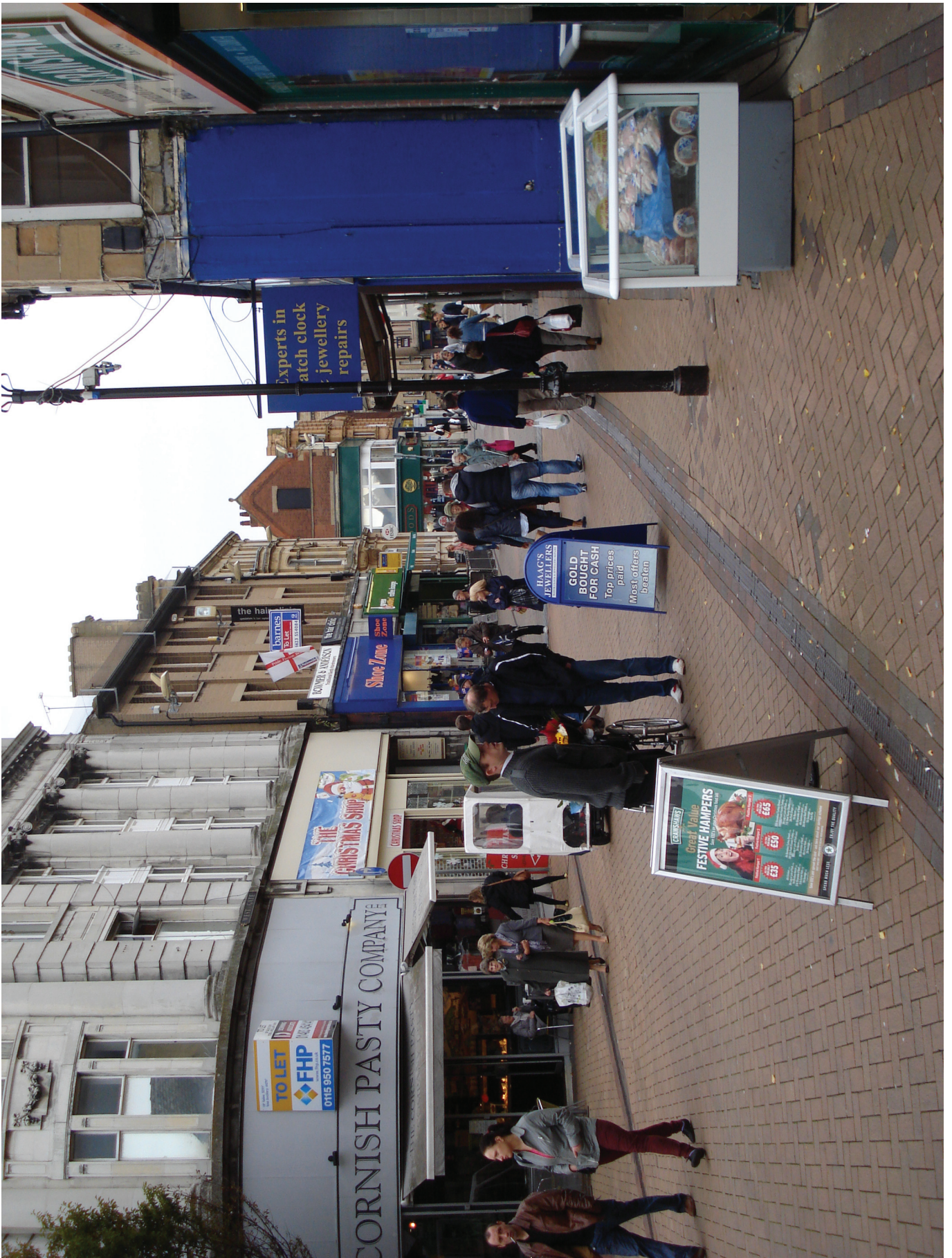
Photograph A for Question 2