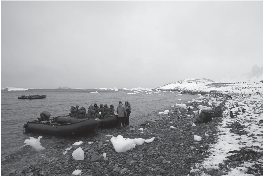
Fig. 3.1 for Question 3