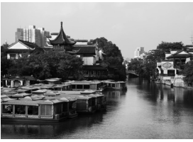
Fig. 1 for Question 1

Nanjing, a city in eastern China, has been selected to host the second summer Youth Olympic Games (YOG) in August 2014. Nanjing has the advanced infrastructure and transport network necessary to meet the needs of the Games, a major sports tourism event.