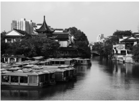
Fig. 1 for Question 1

Nanjing, a city in eastern China, has been selected to host the second summer Youth Olympic Games (YOG) in August 2014. Nanjing has the advanced infrastructure and transport network necessary to meet the needs of the Games, a major sports tourism event.