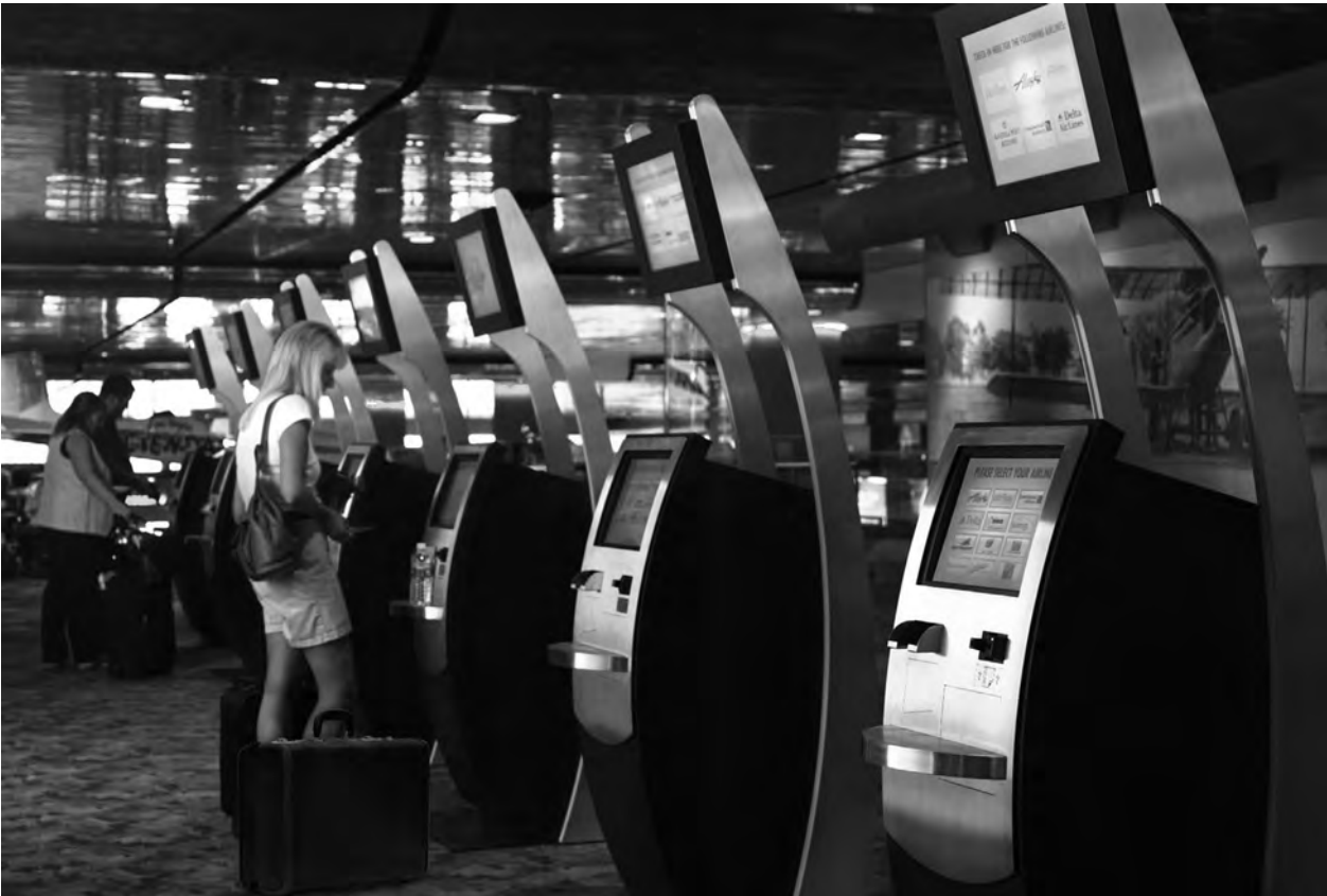
E-Check-in facilities at Suvarnabhumi airport, Bangkok

The new airport offers a variety of facilities, including Thai food shops, Duty Free shops, Children's play areas, Internet cafés, large waiting lounges and VIP lounges.