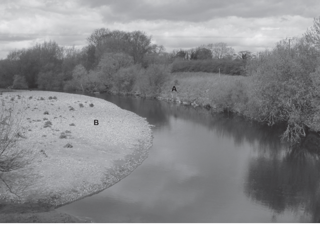
Fig. 1 A meander on the River Swale in North Yorkshire, UK