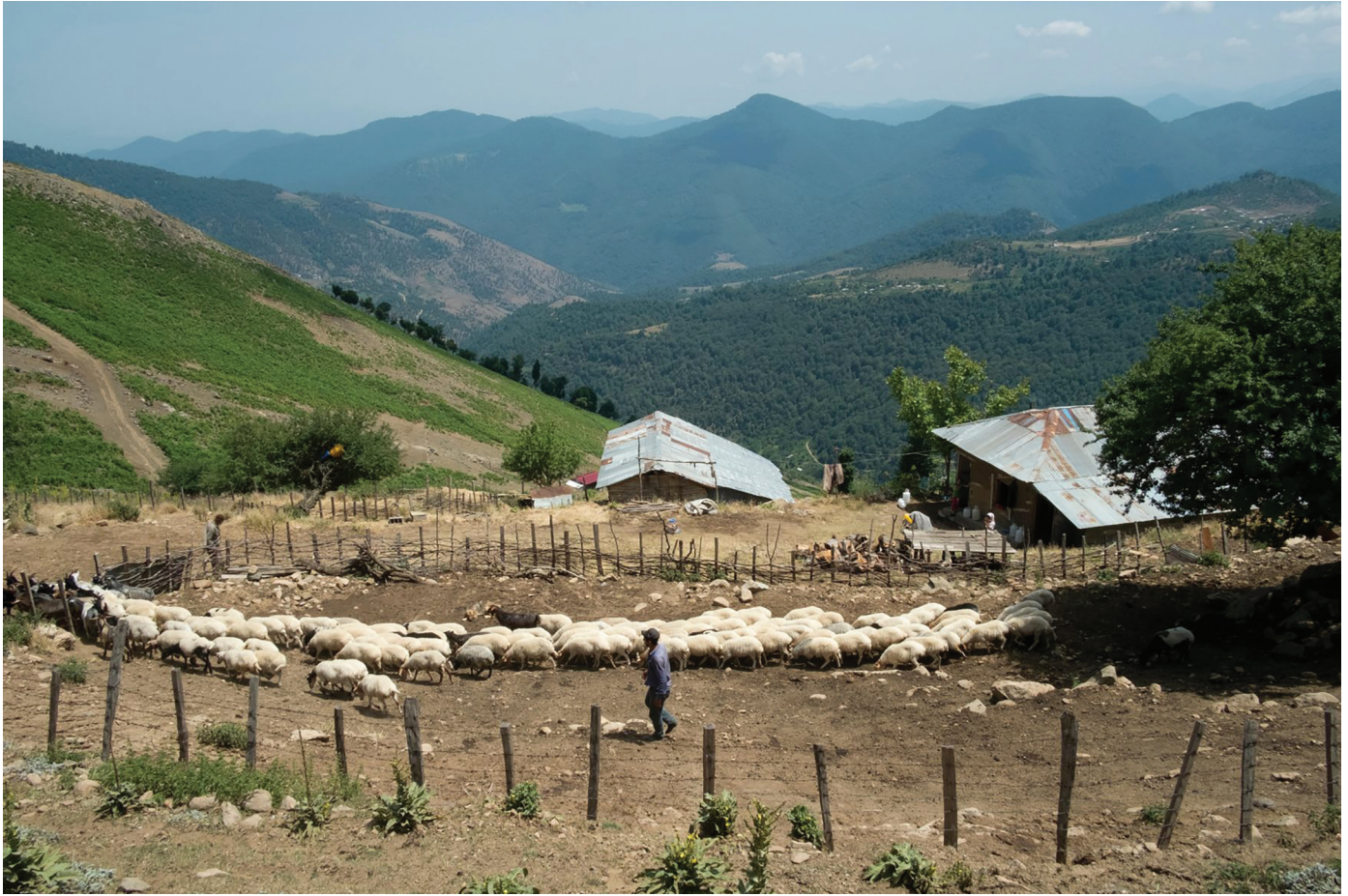
A pastoral farm in Iran, an MIC in the Middle East